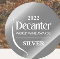
Mimetic 2022 D.O.P. Calatayud